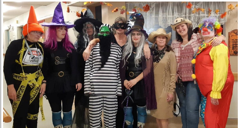
Pictured Above: A group shot of Care Partners who dressed up for our annual Halloween Party. Looking great everyone!