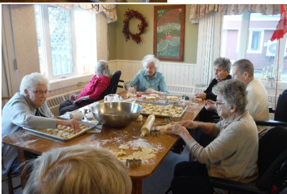
Pictured Above: A group of Residents making shortbread and sugar cookies.

This past month we had many visitors come to Willow Lodge. The Residents as well as the Care Partners always enjoy the visits from the youth in the community, as they never fail to bring a smile to everyone's face. Well, we had the Nursery School, Grade Fives and Grade Sixes from Tatamagouche come to visit in December. It was great fun having them all here. The Nursery School came in with a bundle of energy as they always do, but this time they were full of the Christmas spirit. Each one of the Nursery School participants shared with the Residents what they wanted from Santa for Christmas, sang some carols and made special Christmas ornaments which they distributed to the Residents.