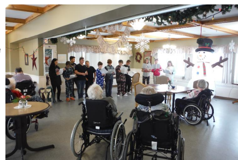
Pictured Right: A group of the Grade Six class singing Christmas Carols to the residents.