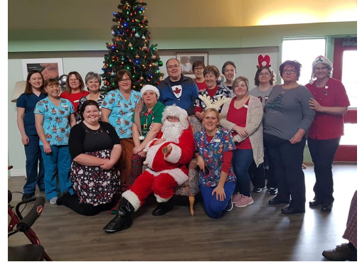
Pictured Right: Some of the Care Partners who worked Christmas Day 2018 with Santa Clause. We apologize if anyone was missed.