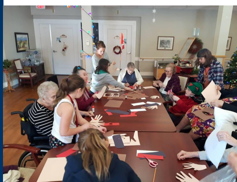
Pictured Left: A group of the grade 5 students and Residents from Lynwood making reindeer.

Next were the Grade Fives, they all came ready to make a Christmas craft with the Residents. The Grade Fives all gathered in different areas of the lodge where they assisted the Residents in making reindeer. There was laughter heard all throughout the lodge that day as there were stories shared from Resident to student and student to Resident. We can't wait to see what this month has in store!