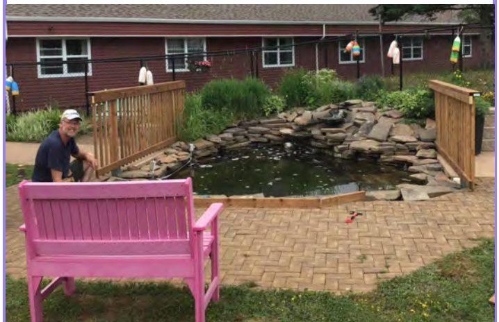
Above is a picture of Achim working on the pond!