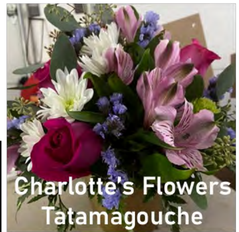
Charlotte's Flowers Tatamagouche